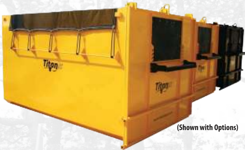
(Shown with Options)