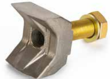
ROTATABLE KNIVES Best for sand or soil conditions