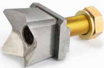
BEAVER TEETH Works for most conditions