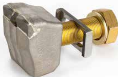
DOUBLE CARBIDES Best for rocky conditions